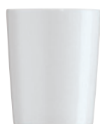
MUG Becher Mug Gobelet

15505 Ø 8 cm - h 9,5 cm - 0,28 L Ø 3 1/8 in. - h 3 3/4 in. - 9 1/2 oz.