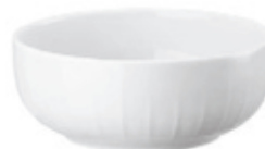
BOWL Schale Coppa Bowl

15428 Ø 8,5 cm - h 5 cm - 0,20 L Ø 2 3/8 in. - h 2 in. - 6 3/4 oz.