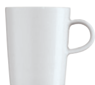
MUG Becher Mug Gobelet

14852 Ø 10,5 cm - h 8,5 cm - 0,44 L Ø 4 1/8 in. - h 3 3/8 in. - 14 7/8 oz.