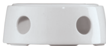
WARMER Stövchen Réchaud Réchaud

14235 Ø 15,5 cm - h 13 cm - 1,10 L Ø 6 1/8 in. - h 5 1/8 in. - 37 1/4 oz. 14232 Only lid Ø 9 cm - h 4,5 cm Ø 3 1/2 in. - h 1 3/4 in.