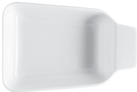
GOURMET PLATE DEEP Gourmetteller tief Piatto gourmet fondo Plate gourmet creuse

15220 Ø 20 cm - h 5,5 cm - Ø 7 7/8 in. - h 2 1/8 in. 10354 Ø 24 cm - h 5,5 cm - Ø 9 1/2 in. - h 2 1/8 in.