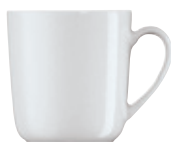
MUG Becher Mug Gobelet

Ø 10 cm - h 6 cm - 0,30 L Ø 3 7 / 8 in. - h 2 3 / 8 in. - 10 1 / 8 oz.