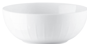
BOWL DEEP Schale tief Coppa fonda Bol creux

13341 Ø 11 cm - h 5,5 cm - 0,35 L Ø 4 1/5 in. - h 2 1/8 in. - 11 7/8 oz. 15757 Ø 15 cm - h 8 cm - 0,88 L Ø 5 7/8 in. - h 3 1/8 in. - 27 3/4 oz.