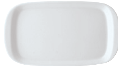
PLATTER RECTANGULAR Platte rechteckig Piatto rettangolare Plat rectangulaire

14232 Only lid Ø 7,5 cm - h 4,5 cm Ø 3 in. - h 1 3 / 4 in.