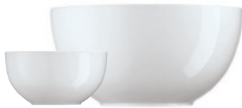
BOWL Schüssel Insalatiera Saladier