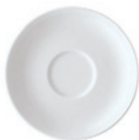
SAUCER Untertasse Piattino Soucoupe