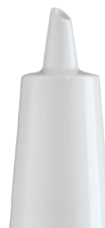
SUGAR SHAKER Zuckerstreuer Dosazucchero Sucrier doseur

14307 Ø 8 cm - h 10 cm - 0,23 L Ø 3 1/8 in. - h 3 7/8 in. - 7 3/4 oz. 14309 Only lid Ø 7,5 cm - h 3,5 cm Ø 3 in. - h 1 3/8 in.