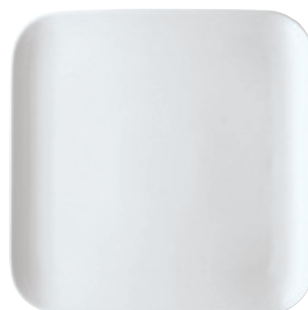
PLATE SQUARE Platte quadratisch Piatto quadrato Plate carré

15324 24,5 x 15,5 cm - 9 2 / 3 x 6 in. 12732 32 x 20 cm - 12 5 / 8 x 7 7 / 8 in. 12736 36 x 22 cm - 14 1 / 8 x 8 5 / 8 in.