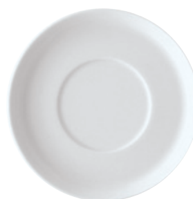
SAUCER Untertasse Piattino Soucoupe