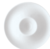
EGG CUP FLANGED Eierbecher mit Ablage Portauovo con falda Coquetier avec bord

15520 Ø 5 cm - h 6,5 cm Ø 2 in. - h 2 1/2 in.