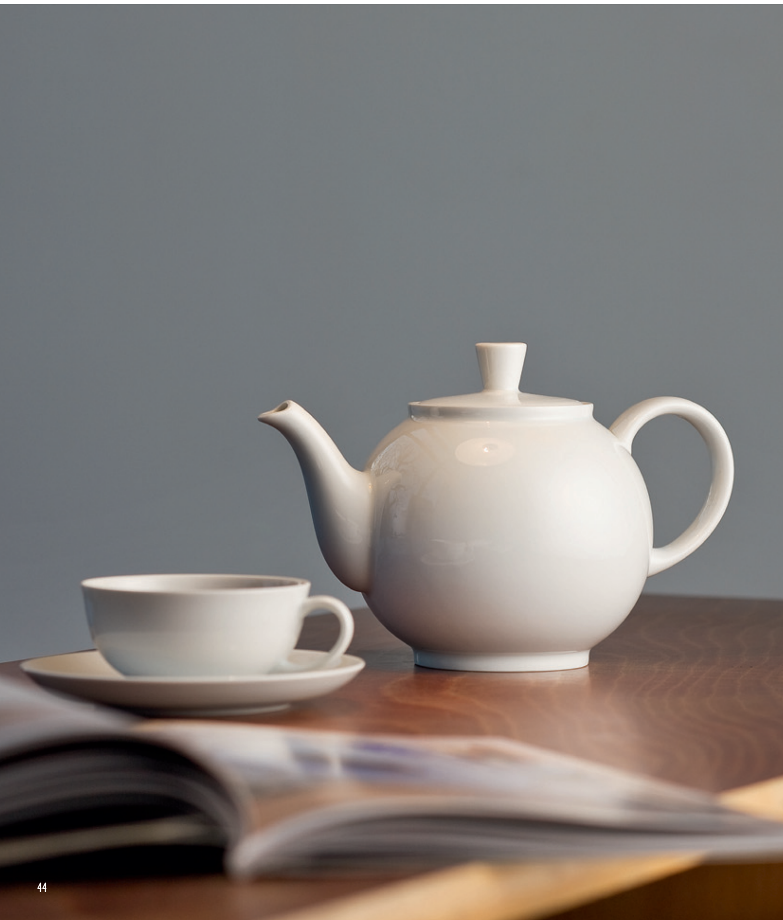
800001 DECOR: WHITE