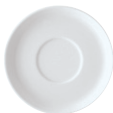
SAUCER Untertasse Piattino Soucoupe