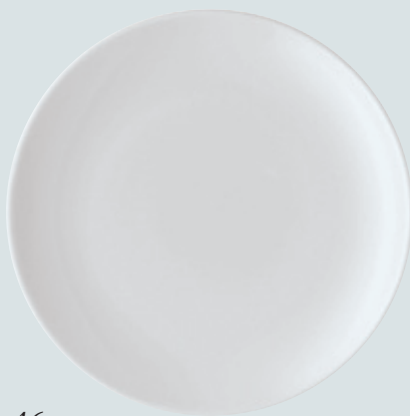
46 FORM 2000