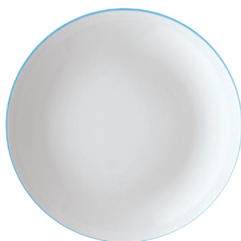
PLATE DEEP Suppenteller Piatto fondo Assiette creuse

10220 Ø 20 cm - Ø 7 7 / 8 in. 10226 Ø 26 cm - Ø 10 1 / 4 in.