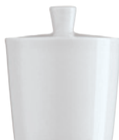
SUGAR BOWL Zuckerdose Zuccheriera Sucrier

14430 Ø 6,5 cm - h 10 cm - 0,20 L Ø 2 1/2 in. - h 3 7/8 in. - 6 3/4 oz.