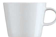
CUP Obertasse Tazza Tasse

14772 Ø 8,5 cm - h 7 cm - 0,22 L Ø 3 3/8 in. - h 2 3/4 in. - 7 1/2 oz.