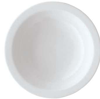
BOWL Schale Insalatiera Saladier

13310 Ø 19 cm - h 7,5 cm - 1,35 L Ø 7 1/2 in. - h 3 in. - 45 5/8 oz. 13322 Ø 22 cm - h 8,5 cm - 2,00 L Ø 8 5/8 in. - h 3 3/8 in. - 67 5/8 oz.