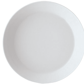
PLATE DEEP Teller tief Piatto fondo Assiette creuse