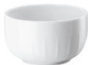
BOWL Schälchen Coppetta Bol

15428 Ø 8,5 cm - h 5 cm - 0,20 L Ø 2 3/8 in. - h 2 in. - 6 3/4 oz.