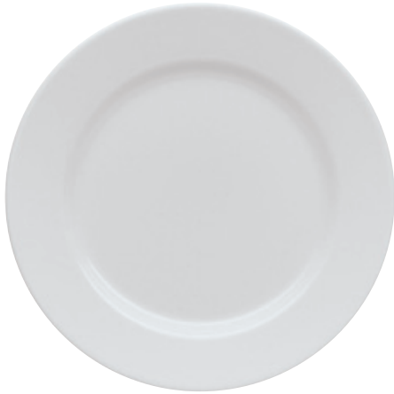
PLATE FLAT Teller flach Piatto piano Assiette plate

10863 Ø 23 cm - Ø 9 in. 10868 Ø 28 cm - Ø 11 in. 10872 Ø 32 cm - Ø 12 5/8 in.