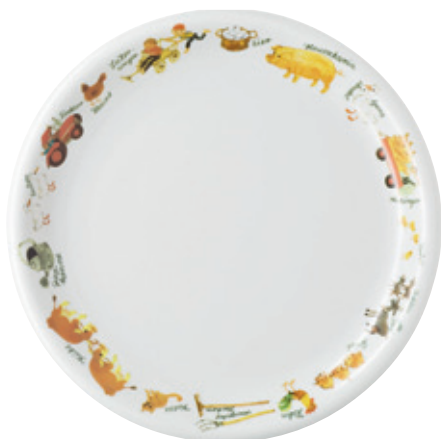
PLATE FLAT Teller flach Piatto piano Assiette plate