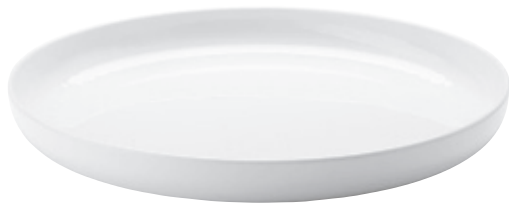
PLATTER Servierschale Coppa Plat à servir

15298 Ø 32 cm - h 4 cm - 2,00L Ø 12 5/8 in. - h 1 5/8 in. - 67 5/8 oz.