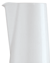
CREAMER Gießler Cremiera Crémier

15670 Ø 17 cm - h 7 cm Ø 6 3/4 in. - h 2 3/4 in.