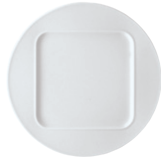
PLATE FLAT, SQUARE WELL

Teller flach, Spiegel eckig Piatto piano, specchio quadrato Assiette plate, centre carré