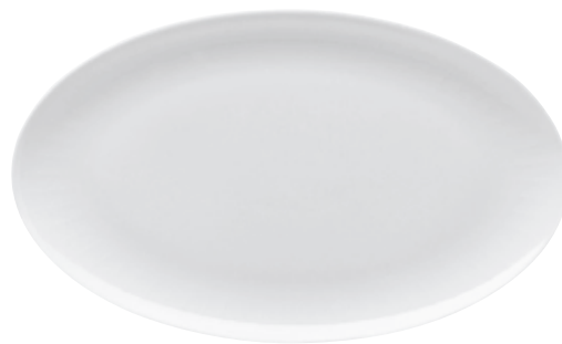
PLATTER OVAL Platte oval Piatto ovale Plat ovale

15298 Ø 32 cm - h 4 cm - 2,00L Ø 12 5/8 in. - h 1 5/8 in. - 67 5/8 oz.