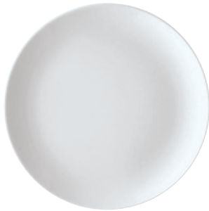
PLATE FLAT Teller flach Piatto piano Assiette plate

10220 Ø 20 cm - Ø 7 7 / 8 in. 10226 Ø 26 cm - Ø 10 1 / 4 in.