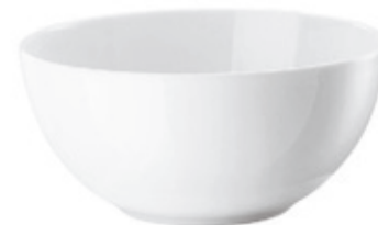
BOWL Schale Coppetta Bol

15384 Ø 14 cm - h 5,5 cm - 0,46L Ø 5 1/2 in. - h 2 1/8 in. - 15 1/2 oz.