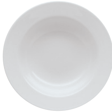
PLATE DEEP Teller tief Piatto fondo Assiette creuse

10863 Ø 23 cm - Ø 9 in. 10868 Ø 28 cm - Ø 11 in. 10872 Ø 32 cm - Ø 12 5/8 in.