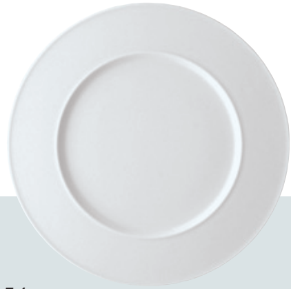
54 FORM 2006