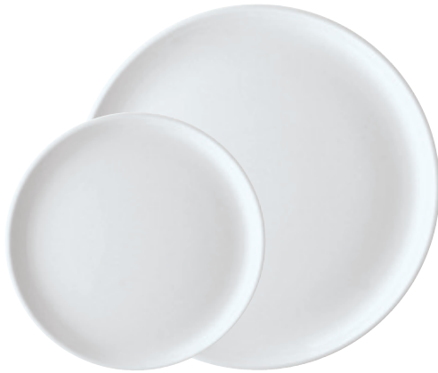
PLATE FLAT Teller flach Piatto piano Assiette plate