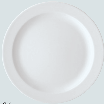
34 FORM 1382