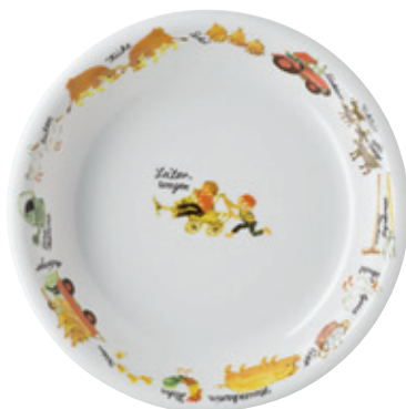
PLATE DEEP Teller tief Piatto fondo Assiette creuse