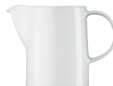
CREAMER Gießler Cremiera Crémier

14309 Only lid Ø 11 cm - h 3,5 cm Ø 4 3/8 in. - h 1 3/8 in.