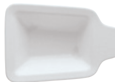
BOWL DEEP Schälchen tief Ciotolina fonda Bol creuse

13434 Ø 20 x 13 cm - h 4,5 cm Ø 7 7/8 x 5 1/8 in. - h 1 3/4 in.