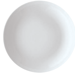
PLATE DEEP Teller tief Piatto fondo Assiette creuse