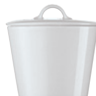
SUGAR BOWL Zuckerdose Zuccheriera Sucrier

14514 Ø 11,5 cm - h 16,5 cm - 1 L Ø 4 1/2 in. - h 6 1/2 in. - 33 7/8 oz.