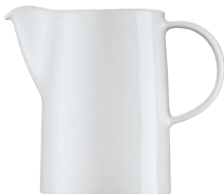
PITCHER Krug Brocca Carafe

15670 Ø 16,5 cm - h 6 cm Ø 6 1/2 in. - h 2 3/8 in.