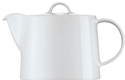
TEAPOT Teekanne Teiera Théière

14144 Ø 13 cm - h 12,5 cm - 0,80 L Ø 5 1/8 in. - h 4 7/8 in. - 27 oz.