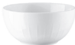
BOWL DEEP Schale tief Coppa fonda Bol creux

15212 Ø 12,5 cm - h 5 cm - 0,38 L Ø 4 7/8 in. - h 2 in. - 12 7/8 oz. 15216 Ø 16,5 cm - h 6 cm - 0,85 L Ø 6 1/2 in. - h 3 3/8 in. - 28 3/4 oz.