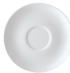
SAUCER Untertasse Piattino Soucoupe