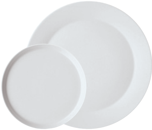
PLATE FLAT Teller flach Piatto piano Assiette plate