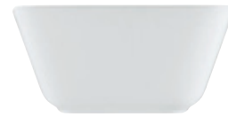
BOWL SQUARE Schüssel quadratisch Ciotola quadrata Bol carré