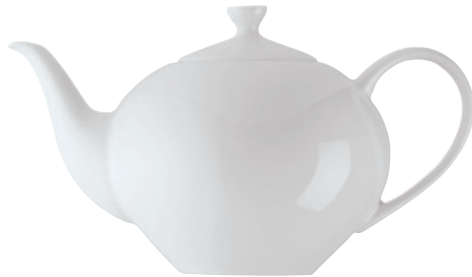
TEAPOT Teekanne Teiera Théière

14220 Ø 10 cm - h 10 cm - 0,35 L Ø 3 7 / 8 in. - h 3 7 / 8 in. - 11 7 / 8 oz.