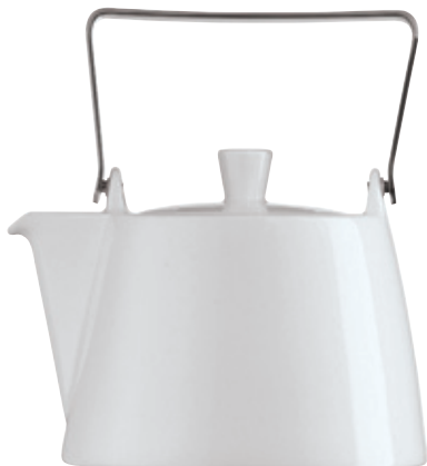
TEAPOT Teekanne Teiera Théière

14235 Ø 15,5 cm - h 13 cm - 1,10 L Ø 6 1/8 in. - h 5 1/8 in. - 37 1/4 oz. 14232 Only lid Ø 9 cm - h 4,5 cm Ø 3 1/2 in. - h 1 3/4 in.