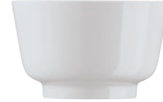
BOWL Schälchen Coppetta Bol

10516 Ø 16 cm - h 4,5 cm - 0,35 L Ø 6 1/4 in. - h 1 3/4 in. - 11 7/8 oz.