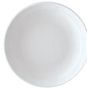
PLATE DEEP Teller tief Piatto fondo Assiette creuse