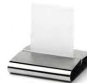
Soporte menú base Menu card holder-flat Porte-menu Porta menù Speisekartenhalter