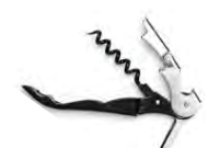
Sacacorchos Waiter's corkscrew Tire-bouchon de serveur Cavatappi cameriere Kellnermesser