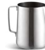
Jarra agua Water jug Carafe d'eau Caraffa d'acqua Wasserkaraffe