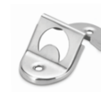
Abre botellas pared Wall mount bottle opener Décapsuleur mural Levacapsule Wandfl aschenöffner