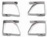
Pisamanteles pack 4 Tablecloth clip Clips nappe Molle fermatovaglia Teilige tischdeckenklipse