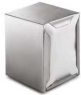
Servilletero Napkin dispenser Distributeur serviettes Portasalviette Serviettenhalter