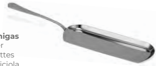
Pala recogemigas Table crumber Ramasse-miettes Paletta per briciola Tisch-krümelkehrer