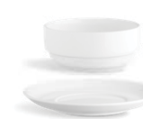
PRI 1717 saucer 17 cm