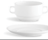
PRI 1716 saucer 16 cm