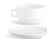
PRI 1717 saucer 17 cm