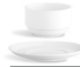
PRI 1716 saucer 16 cm