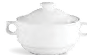
PRA 4326 souptureen 2,6 l