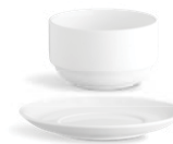
PRI 1717 saucer 17 cm