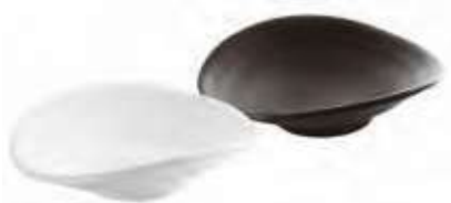
Bowl Ciotola Schüssel Bol Cuenco Ensalada