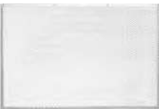
Pizza screen, aluminum Retina pizza, alluminio Pizzanetzscheibe, Aluminum Toile à pizza, aluminium Red para pizza, aluminio