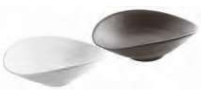
Bowl Ciotola Schüssel Bol Cuenco Ensalada