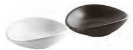
Bowl Ciotola Schüssel Bol Cuenco Ensalada