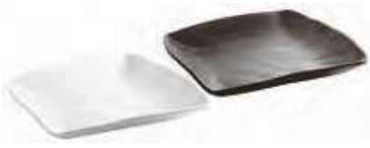
Tray Vassoio Platte Plateau Bandeja