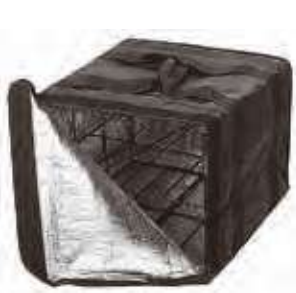
Pizza delivery bag with rack Borsa isotermitica con rastrelliera Thermo-Tasche mit Gestell Sac thermique avec étagère Bolsa térmica con rack