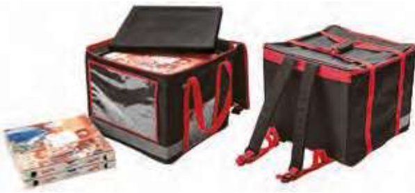
Pizza delivery backpack Zaino isotermitico Thermo-Rucksack Sac à dos thermique Mochila térmica