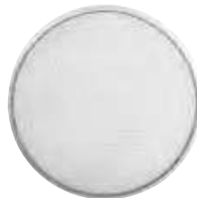
Pizza screen, aluminum Retina pizza, alluminio Pizzanetzscheibe, Aluminum Toile à pizza, aluminium Red para pizza, aluminio