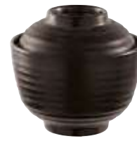
Soup/riso bowl with lid Ciotola riso con coperchio Reisschüssel mit Deckel Bol à riz avec couvercle Cuenco arroz con tapa