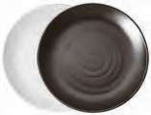
Dish Piatto Teller Assiette Plato