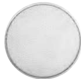
Pizza screen, aluminum Retina pizza, alluminio Pizzanetzscheibe, Aluminum Toile à pizza, aluminium Red para pizza, aluminio