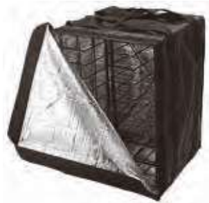
Pizza delivery bag with rack Borsa isotermitica con rastrelliera Thermo-Tasche mit Gestell Sac thermique avec étagère Bolsa térmica con rack