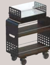
70 x 37 x 100 cm