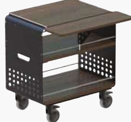
78 x 51 (75) x 87 cm