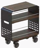
70 x 37 x 87 cm