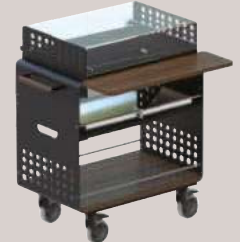
93 x 51 (75) x 110 cm