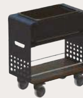
70 x 37 x 78 cm