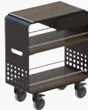
70 x 37 x 87 cm