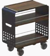
70 x 37 x 79,7 cm