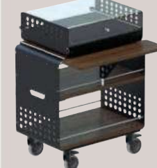
78 x 51 (75) x 120 cm