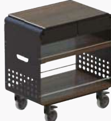
78 x 51 x 87 cm