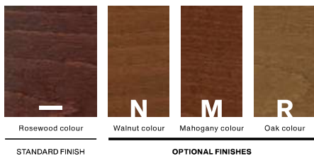
STANDARD FINISH: Rosewood colour OPTIONAL FINISHES: Walnut colour, Mahogany colour, Oak colour