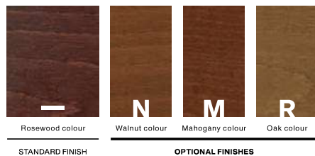
STANDARD FINISH: Rosewood colour OPTIONAL FINISHES: Walnut colour, Mahogany colour, Oak colour