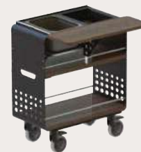
70 x 37(61) x 87 cm