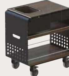
78 x 51 x 87 cm