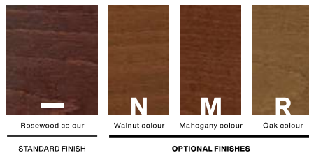
STANDARD FINISH OPTIONAL FINISHES