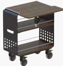
70 x 37(61) x 87 cm