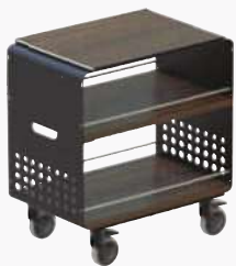
78 x 51 x 87 cm