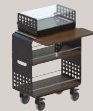
70 x 37 x 110 cm